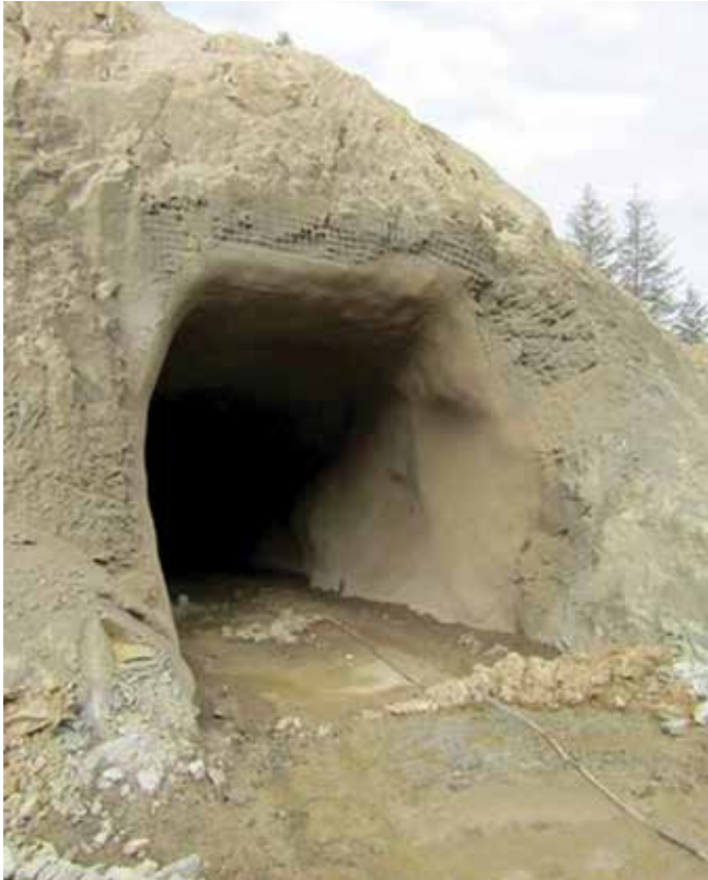
Fig. 4: Tunnel portal

Working in confined spaces, as well as having no radio service in the tunnels, provided interesting challenges for the coordination of the shooting over the 1000 ft (300 m) of tunnel. As the shotcrete equipment had to be stationed