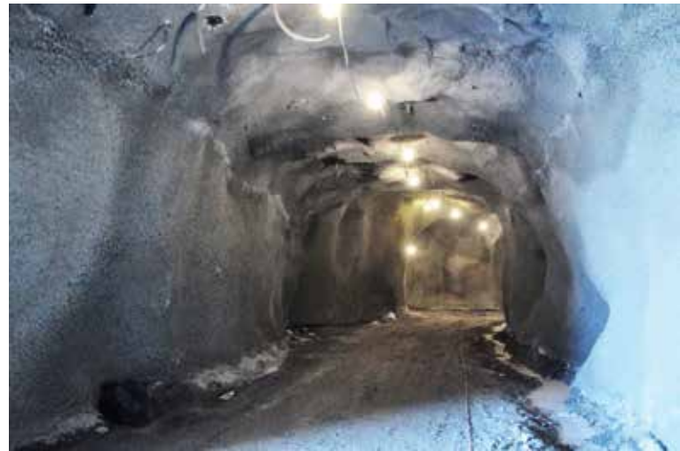
Fig. 2: Main tunnel