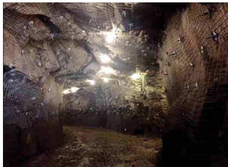
Fig. 3: Tunnel prior to shotcrete