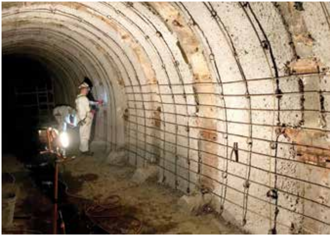
Fig. 3: Installing second mat of steel

concrete mixer truck that fed the mixer on the pump. Mixing the material in smaller batches helped maintain stricter quality standards because the amount of water added to the mixture and the mixing time were both closely monitored. The staging area required for the entire shotcrete operation was small and mobile. The only equipment needed on the project were a volumetric mixer, concrete mixer-pump, and air compressor. On a busy, crowded construction site, this small footprint and setup flexibility was appreciated as the surrounding construction continued and the site setup needs evolved. If the traditional form-and-pour method was used, a significantly larger staging area would be needed to accommodate all the equipment.