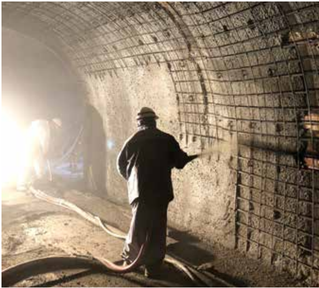
Fig. 9: Placement of second layer of shotcrete

In summary, a heavily traveled street in downtown Washington, DC, plus an active sanitary sewer that needed to remain fully functional with only a standard manhole available to access the work meant that shotcrete was THE option to complete the rehabilitation of this large-diameter sewer.