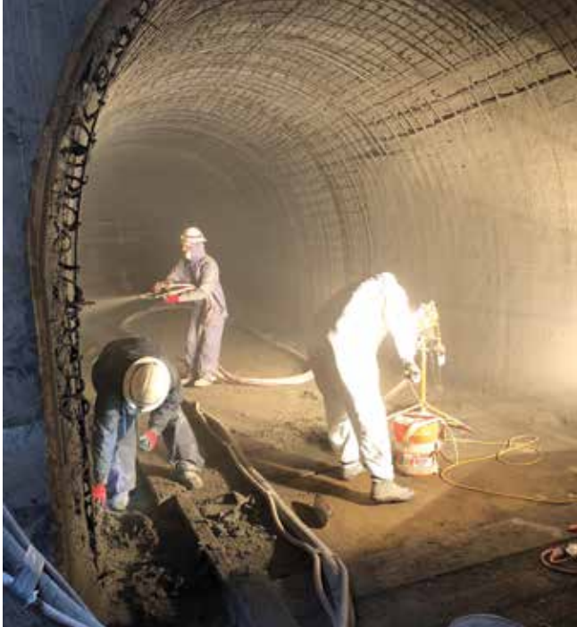
Fig. 7: Placement of second layer of shotcrete

Due to the new OSHA silica regulations, the worksite was constantly being vacuumed and dust producers were wet-down to prevent any excess dust. All employees were also fitted with the appropriate respirators to comply with the new regulations and the confined space environment. Airborne silica was also of great concern as the work was being performed in a busy pedestrian area; containment and filtering systems were key to ensuring their safety. Because