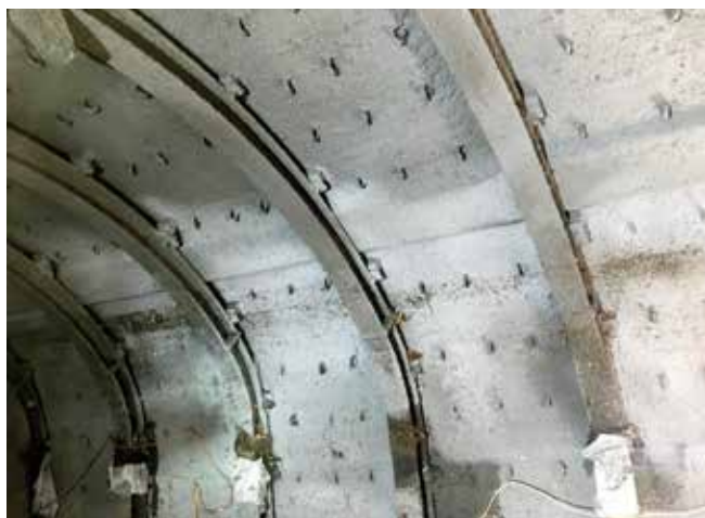
Fig. 1: Installing first shotcrete layer

Site access was also a consideration in the selection of the concrete repair material. The material availability needed to synchronize with the availability of work in the sewer. Concrete trucks were not considered a viable option due to past negative experiences trying to get relatively small quantities of concrete delivered on time and still meet the required specification through Washington, DC's notoriously foul traffic. The project site was in the middle of high-end residential and commercial buildings, so the dust creation associated with dry-mix placement methods was also a concern. Ultimately, prepackaged shotcrete material was mixed on site and placed with a combination concrete mixer-pump. King Packaging Materials MS-W1, a silica fume-enhanced, prepackaged shotcrete mixture designed for wet-mix placement, was selected for its superior consistency and excellent pumpability, though limited storage space on site necessitated a careful control of material lead times and delivery schedules. The concrete was ordered in bulk bags and loaded into the hopper of a volumetric