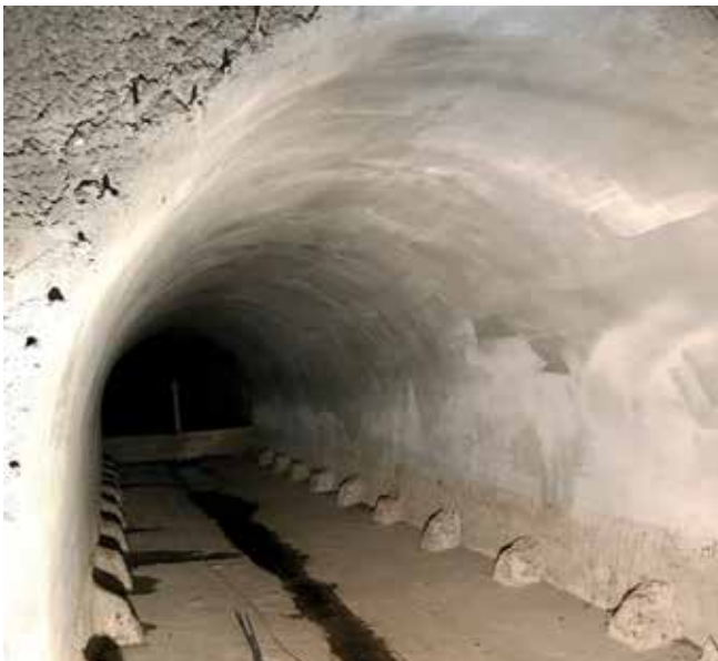
Fig. 10: One barrel of double barrel section completed