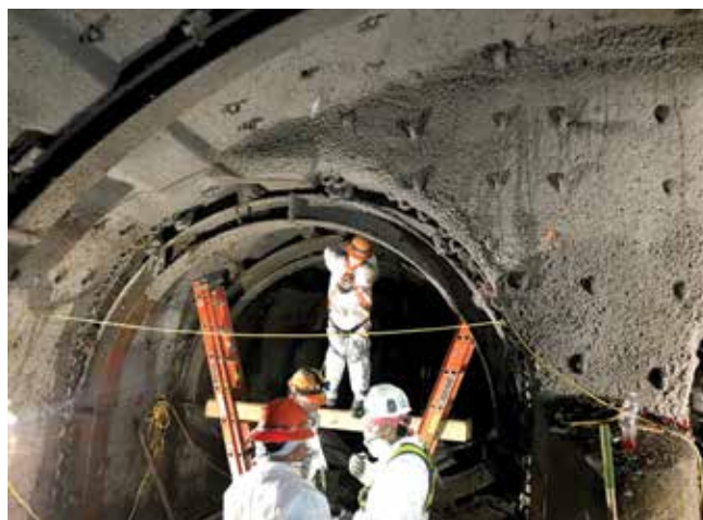
Fig. 2: Removing preexisting bents