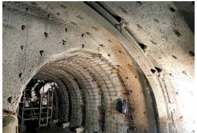
Fig. 5: First layer of shotcrete installed with preexisting support bents still in place