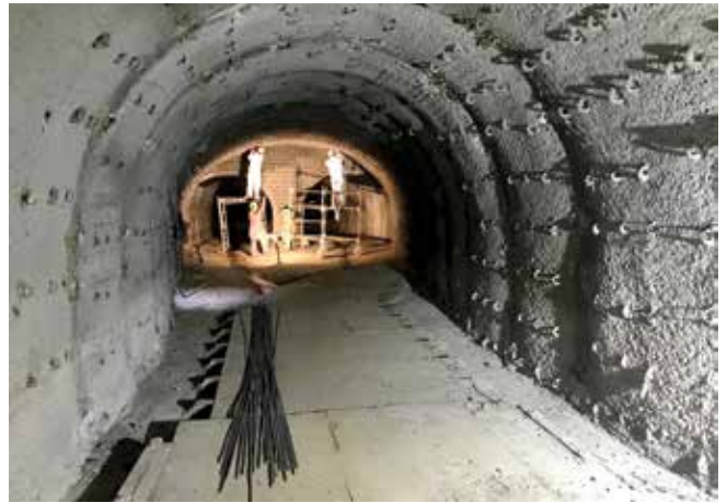
Fig. 4: Single bore prepared to receive second mat of steel

Coastal Gunite convinced the Owner and Engineer to allow us to shoot in multiple layers as opposed to full-thickness applications. This is possible because properly prepared and placed shotcrete in layers structurally acts as monolithic concrete. This was a faster and more efficient method for placing the material and allowed for easier removal of the existing steel supports between the shotcrete arches. Sika Sigunit L72 AF liquid accelerator was introduced at the nozzle allowing a rapid initial set and the shotcrete to be installed in thicker layers (8 to 10 in. [200 to 250 mm]) than otherwise would have been possible. It also