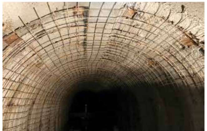
Fig. 6: Second mat of steel installed

allowed the concrete to be pumped with a greater slump, reducing the risk of plugged delivery lines and reduced stress on the shotcrete pump. The rapid strength gain and high compressive strength value allowed for more production during short working periods. The shotcrete was placed overhead in an underground arched sewer, which added complexity to the project, but it was easily overcome with good-quality, wet-mix shotcrete and a qualified contractor with an ACI-certified nozzleman.